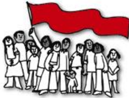
Illustrations borrowed from our friends' Democratic Socialists of America's "Towards Freedom: Democratic Socialist Theory and Practice."

CSP PO Box 57-8398 Chicago IL 60657-8398 chgosp@juno.com chicagosocialistparty.com